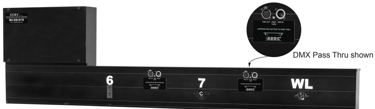
Shown with Extended Junction Box