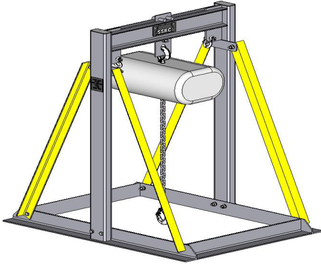
Chain Hoist Stand with Hoist